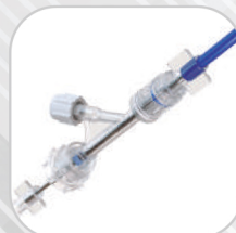
Pullback Delivery System