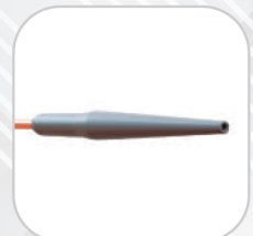
Atraumatic Flexible Tip