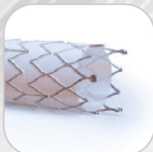
3 Tantalum Marker Bands [Distal/Proximal]